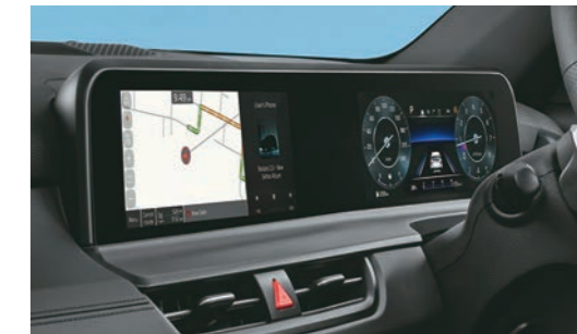
Intuitive 26.03 cm (10.25") HD Touchscreen Navigation + Full Digital Cluster with 26.04 cm (10.25") Color LCD MID