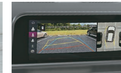
360° Camera with Blind View Monitor in Cluster