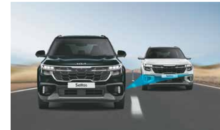
Blind Spot Collision Warning (BCW)