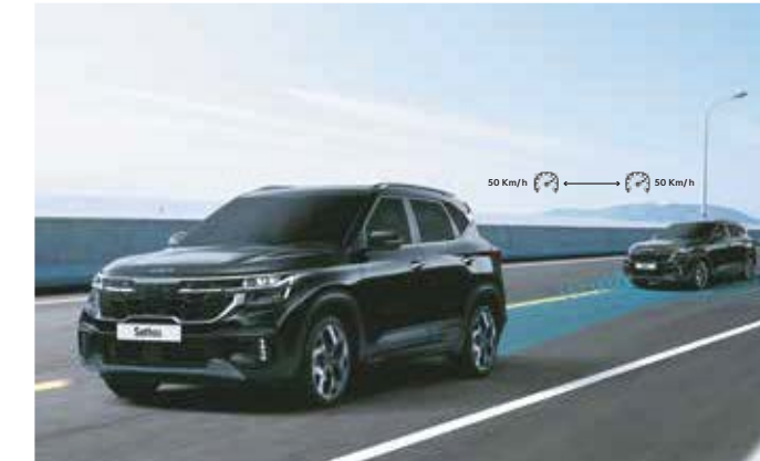
Smart Cruise Control with Stop and Go

The new Seltos helps you manoeuvre with badass confidence on the road with the help of an advanced automated technology - the Advanced Driver Assistance System (ADAS) encompassing 17 Autonomous Level 2 features. It uses camera and radars to detect any obstacle on your path or driver error and in turn, alerts the driver and activates possible safeguards in the car by automating driving controls. Thereby ensuring that you have a safer, more intuitive and rewarding driving experience.