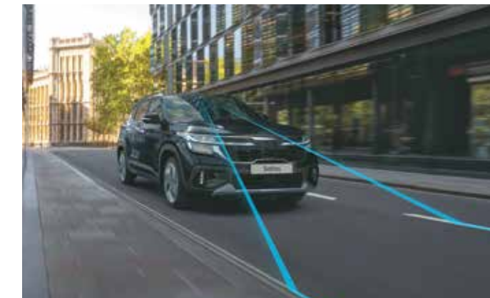
Lane Keep Assist (LKA)