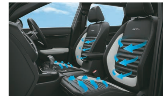
Comfortable Front Ventilated Seats with 8-way Power Driver's Seat

There's no better way to travel than in the new Seltos. The awe-inspiring new interiors are reimagined to look aesthetically stylish and edgy with generous space that offer you a supremely comfortable drive. With a whole new range of state-of-the-art features like the Electric Parking Brake, Smart Pure Air Purifier with virus and bacteria protection and Bose Premium Sound System with 8 Speakers, the new Seltos takes your driving comfort to the next level.