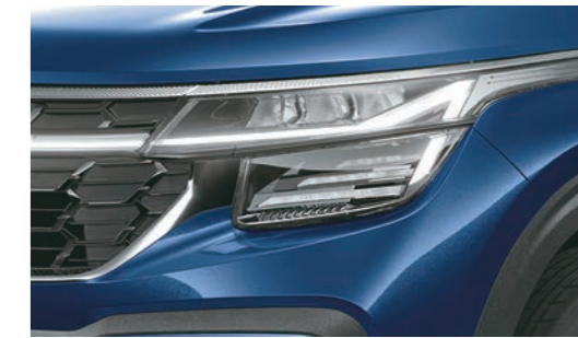
Dazzling Crown Jewel LED Headlamps with Star Map LED DRLs & Star Map Sweeping LED Light Guide

A bold new design with more style and attitude. The exterior design of the new Seltos highlights its bold traits. Its aggressive design language and a muscular built is further accentuated by athletic shoulder lines and a more stylized front and rear to emphasize its robust character. The reinvented Seltos is here to take on every road.