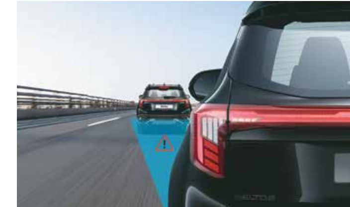
Front Collision Warning and Avoidance Assist (FCW and FCA)