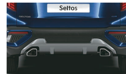
Stylish Dual Sport Exhaust (G1.5T Only)