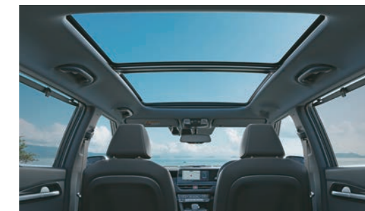
Awe-inspiring Dual Pane Panoramic Sunroof