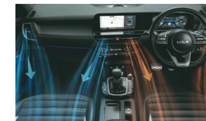
Remote AC Control