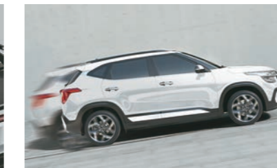
Electronic Stability Control (ESC), Hill Assist Control (HAC) & Vehicle Stability Management (VSM)