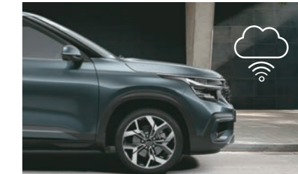
OTA Map & System Update