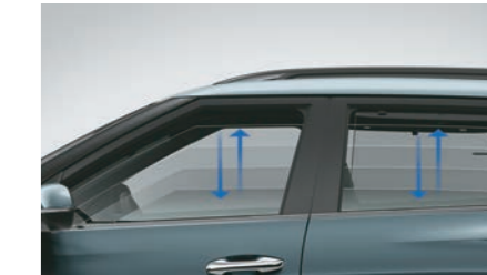
Voice Controlled Window Function