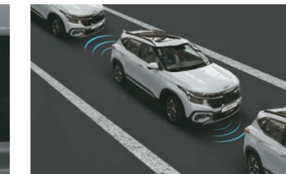
Attentive Front and Rear Parking Sensors