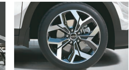
All Wheel Disc Brakes