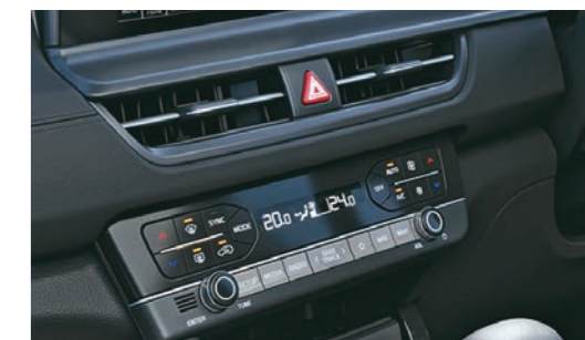
Intelligent Dual Zone Fully Automatic Air Conditioner